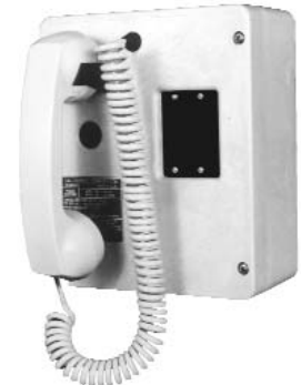
247-001 Indoor Phone