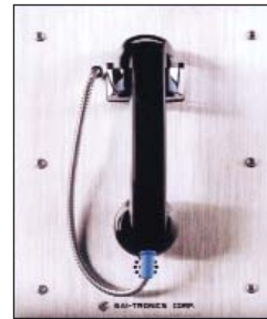
277-001 Flush Panel Phone