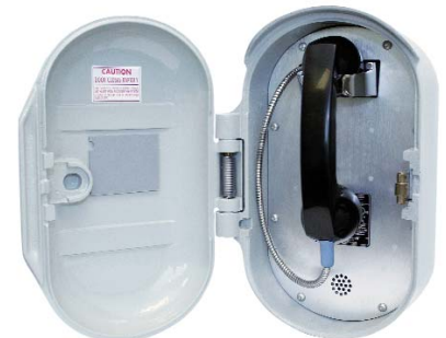
277-001 Tough Phone

GAI-Tronics® wide variety of indoor and outdoor Industrial Telephones are designed for those applications where standard telephones are not environmentally suitable. Such applications include public areas, plant entrances, college campuses, airports, commercial locations, parking garages and amusement parks.